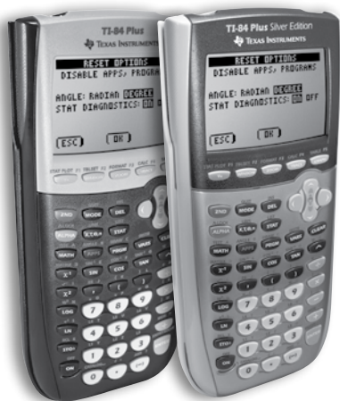
TI-84 Plus & TI-84 Plus Silver Edition