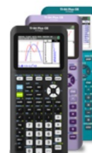
TI-84 Plus CE