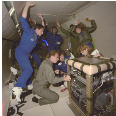
Figure 2: Astronaut crew training onboard the C-9 aircraft in preparation for the Microgravity Science Laboratory missions flown on the Space Shuttle Columbia in April and July of 1997.

When astronauts are in orbit, either in the space shuttle or on the International Space Station (ISS), Earth's gravitational force is still working on them. However, astronauts maintain a feeling of weightlessness, since both the vehicle and crew members are in a constant state of free-fall. Even