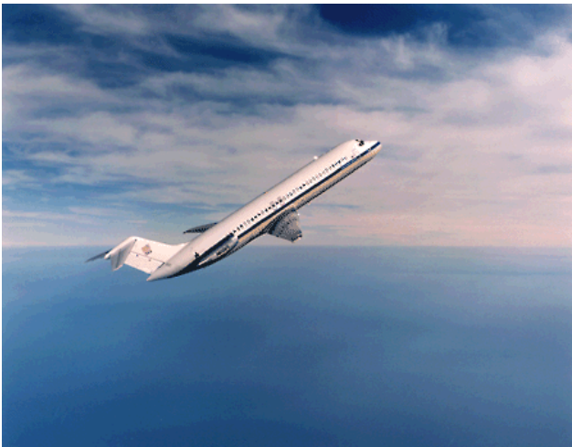
Figure 1: C-9 jet going into a parabolic maneuver.

In our quest to explore, humans will have to adapt to functioning in a variety of gravitational environments. Earth, Moon, Mars, and space all have different gravitational characteristics. Earth's gravitational force is referred to as one Earth gravity, or 1g . Since the Moon has less mass than the Earth, its gravitational force is only one sixth that of Earth, or 0.17g . The gravitational force on Mars is equivalent to about 38% of Earth's gravity, or 0.38g . The gravitational force in space is called microgravity and is very close to zero- g .