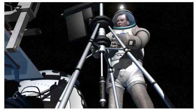
Figure 2: Astronaut services a surface instrument (NASA concept)

Such instruments may measure the radiation received from solar flares or characterize micrometeorites impacting the surface. Telescopes may also be set up for observations of Earth, other planets, and stars.