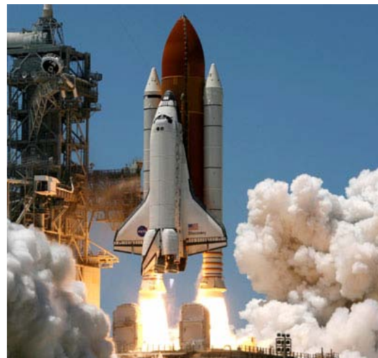
Figure 2: Space Shuttle Discovery at liftoff

The ascent phase begins at liftoff and ends when the space shuttle reaches Earth's orbit. The space shuttle must accelerate from zero to approximately 7,850 meters per second (which is approximately 17,500 miles per hour) in eight and a half minutes to reach the minimum altitude required to orbit Earth. It takes a very unique vehicle to accomplish this task.